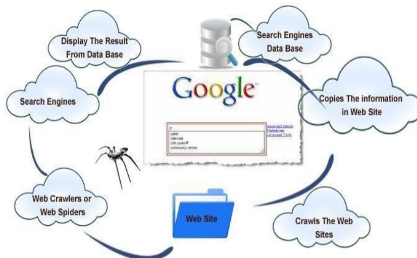
Fig 3 show how search engine work

Search engines have existed for about 2 decades now, and many people know how they work. Up until a few years ago, SEO used to be a simple case of finding some keywords and then building links based on them. This resulted in a lot of spam and low-quality search results on Google.