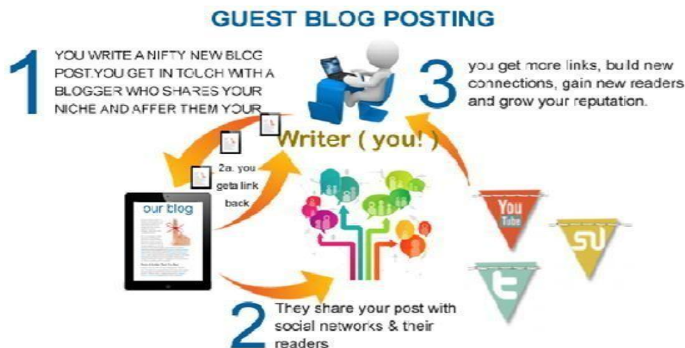
Fig 4 Show how blog post work and help improve rank

Positive and constructive comments from consumers help maintain a respectable business image, and they are also a valuable advertising method. Improve your site's rankings and increase your incoming traffic. The guest post contains links to your website that readers can follow. Your website is exposed to a wider audience, which can drive further traffic. Guest posts are usually of higher quality. Guest posting improve rank through search engine holders.