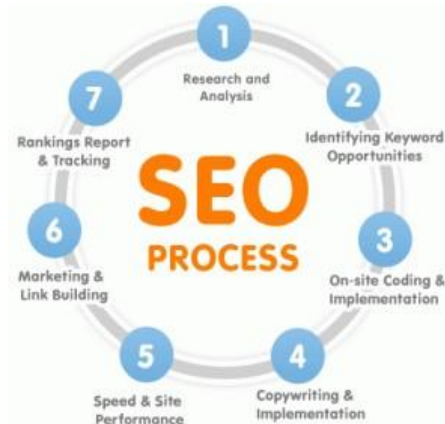
Fig1. SEO Process